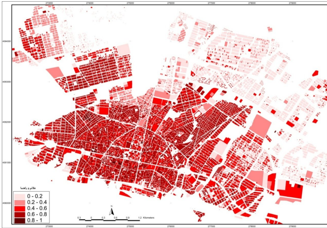
Fig 2: overall vulnerability based on the used criteria using AHP

building material and applying the construction standard as the 2800 construction act.(Table 6)